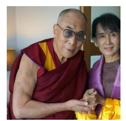
Dalai Lama and Aung San Suu Kyi

threats were made. Bombardier Inc announced one of its biggest contracts ever in China not long after our prime minister spoke about Canadian values in the world. In short, bluster aside, the Party in Beijing appears to respect those who stand up for universal values.