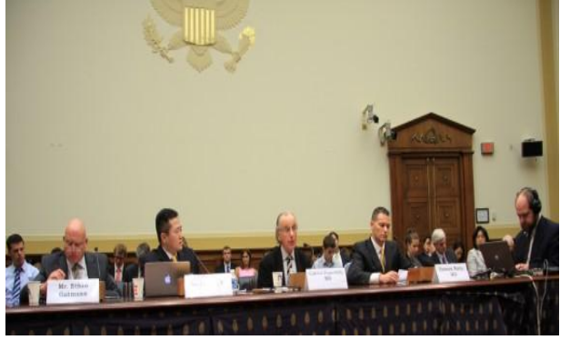
US Congressional Committee in hearing

In September 2006, Congress held a hearing on organ harvesting from Falun Gong. <a href="http://commdocs.house.gov/committees/intlrel/hfa30146.000/hfa30146">http://commdocs.house.gov/committees/intlrel/hfa30146.000/hfa30146</a> of.htm